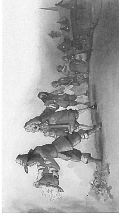
A virtual bucket line