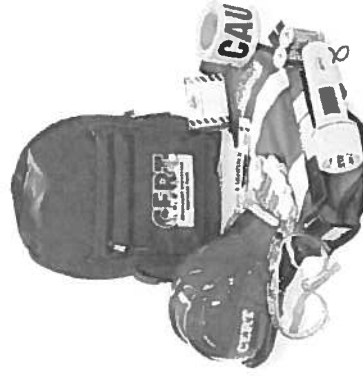
A joint CERT-in-a-box tool